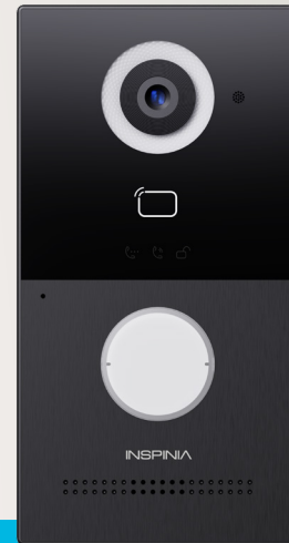
INS-SB24 Single Button Outdoor Unit

Enhance communication in your home or building with INSPINIA 's advanced intercom solutions, seamlessly integrated with smart home and building automation systems.