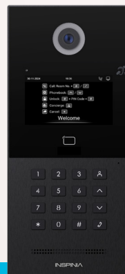
INS-K4A24 4.3" Keypad Outdoor Unit

Enhance communication in your home or building with INSPINIA 's advanced intercom solutions, seamlessly integrated with smart home and building automation systems.